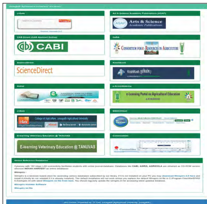
E-Resources facilities for UG/PG Student

In collaboration with the University Library, IT Cell makes all of the accessible e-Resources in agriculture, including CAB, AGRIS, and AGRICOLA, available to UG/PG students for their research projects and to University personnel engaged in research and teaching activities over a local area network (LAN). Using this method, the user may obtain rapid information from a computer on any reference relevant to agricultural research through the usage of a computer network. Also made accessible is an online access to the Consortium for eResources in Agriculture (CERA), which allows users to browse and search for national and international journals. It is also possible to access KrishiPrabha, an online doctoral theses service of the All India Agricultural University through Hissar Agricultural University. Users can also access the J-Gate online database through the website. This has resulted in significantly faster reference services for scientists and students, as well as significant time savings for them.