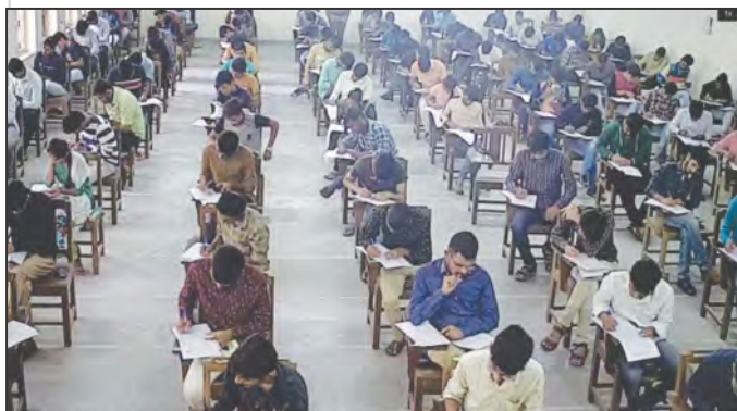
CCTV Surveillance System

The university has a well-established surveillance system, which contains more than 750 CCTV cameras with central and distributed monitoring system, among other things.